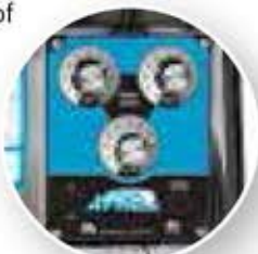
Throwing Wheel Dials

convert to throw a 7.5" undersized vision training ball. (No synthetic balls)